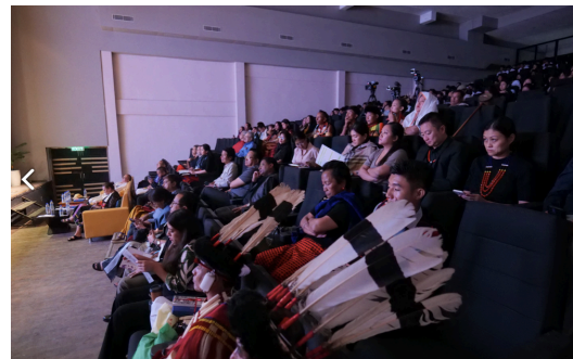
The Listener Festival: Nagaland was held at Lorin Hall of Tetso College, Dimapur.