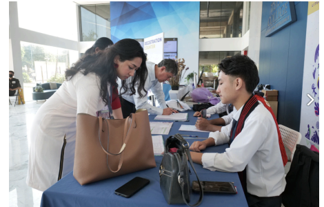
Tetso College of Dimapur, Nagaland, was the venue of The Listener: Nagaland and the Intangible Cultural Heritage Capacity Workshop.