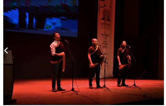
Colored Keys , a folk-rock trio from Nagaland.