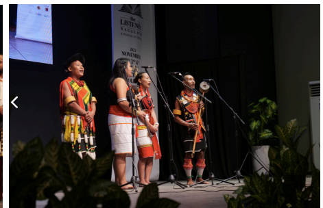
The inauguration Concert featured singers from the Chakhesang, one of Nagaland's 17 tribes.