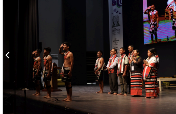
Heraka prayer ritual of the indigenous religion of the Zeliang tribe of Nagaland..